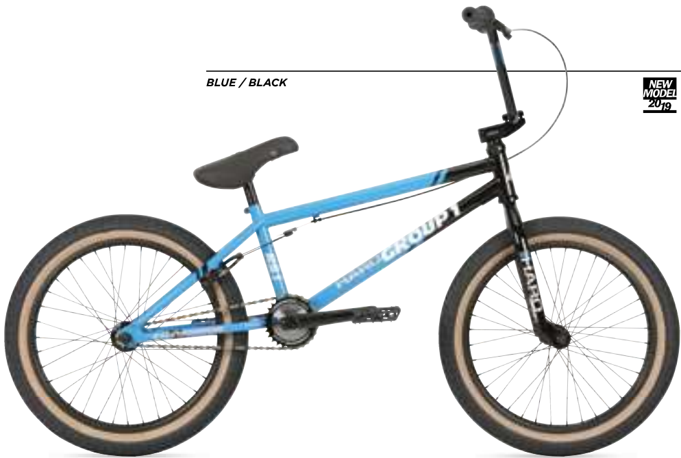
BLUE / BLACK