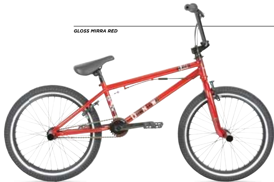
GLOSS MIRRA RED