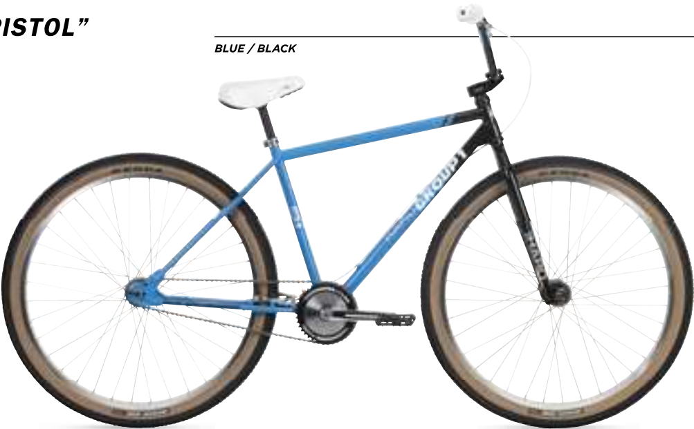
BLUE / BLACK